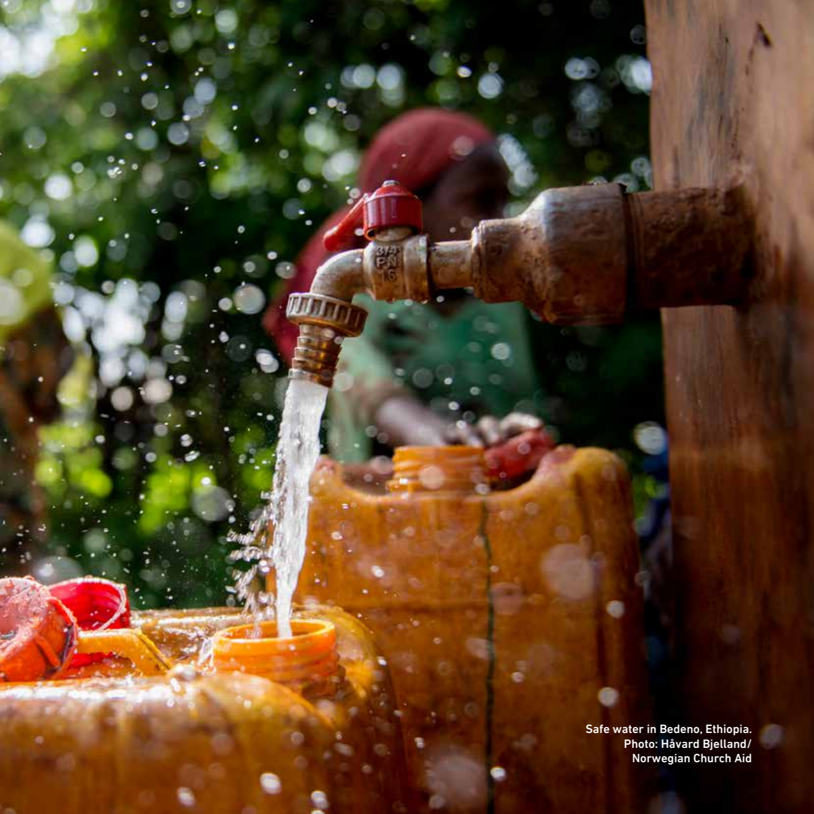
Safe water in Bedeno, Ethiopia.