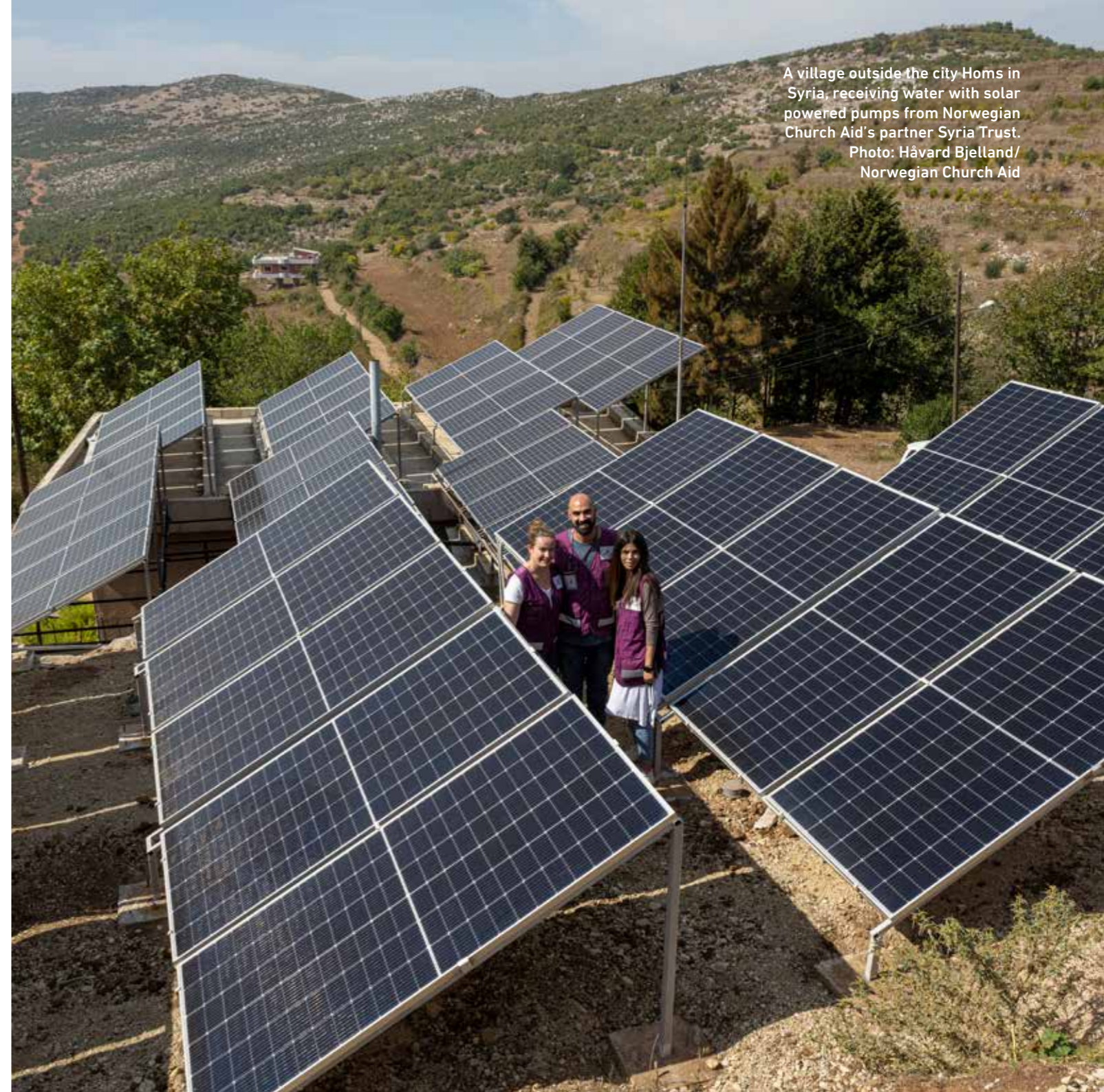
A village outside the city Homs in Syria, receiving water with solar powered pumps from Norwegian Church Aid's partner Syria Trust.

There is a need for better coordination and cooperation between different actors in order to make progress to end poverty and respond to growing humanitarian crisis. Norwegian Church Aid has developed relationships with specialised professional organisations and institutions in relevant fields who can act as resource organisations for faith- and value-based partners. This way they can contribute with a wide range of knowledge, competencies and skills that might not be readily available within faith-based institutions or local civil society organisations. Resource organisations complement civil society actors' ability to reach and mobilise all segments of society and strengthen their competence and networks. Specifically, there is a need to encourage further collaboration between faith actors and women's rights organisations in pursuit of gender justice.