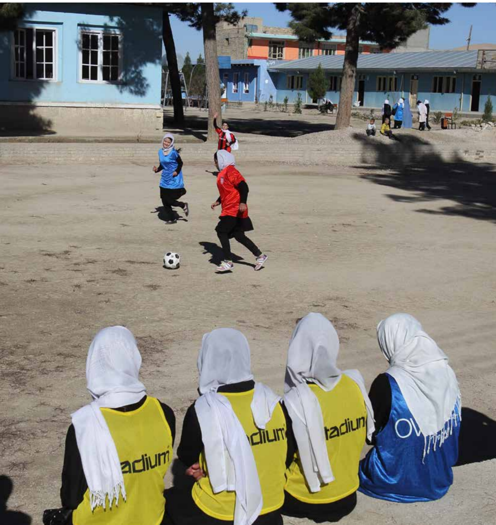
Religious scholars facilitated the integration of girls in a sports for peace program in Afghanistan.