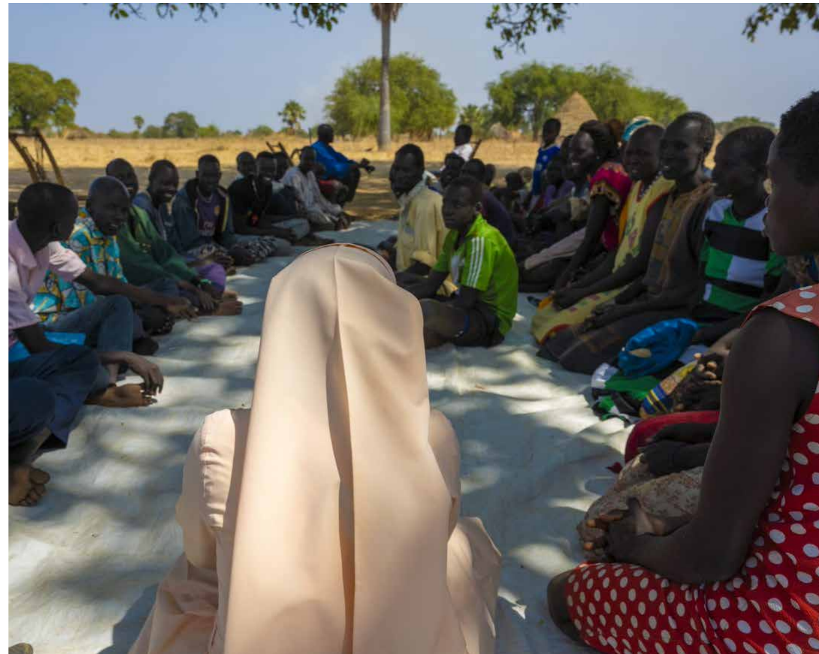
Sisters from the Society of Daughters of Mary Immaculate conduct peace consultations in South Sudan.

RELIGION AND VIOLENCE: NCA should further explore the complex association between religion and violence. It should develop ways to enhance theological understanding and interpretations of peace and support the production of theological counter-narratives to violence. NCA should also provide arenas for, and involve religious actors in, tangible and context-specific dialogues on issues like religion and violence, the relationship between confrontation and empathy, and about exactly what actions, methods and timings constitute legitimate self-defence.