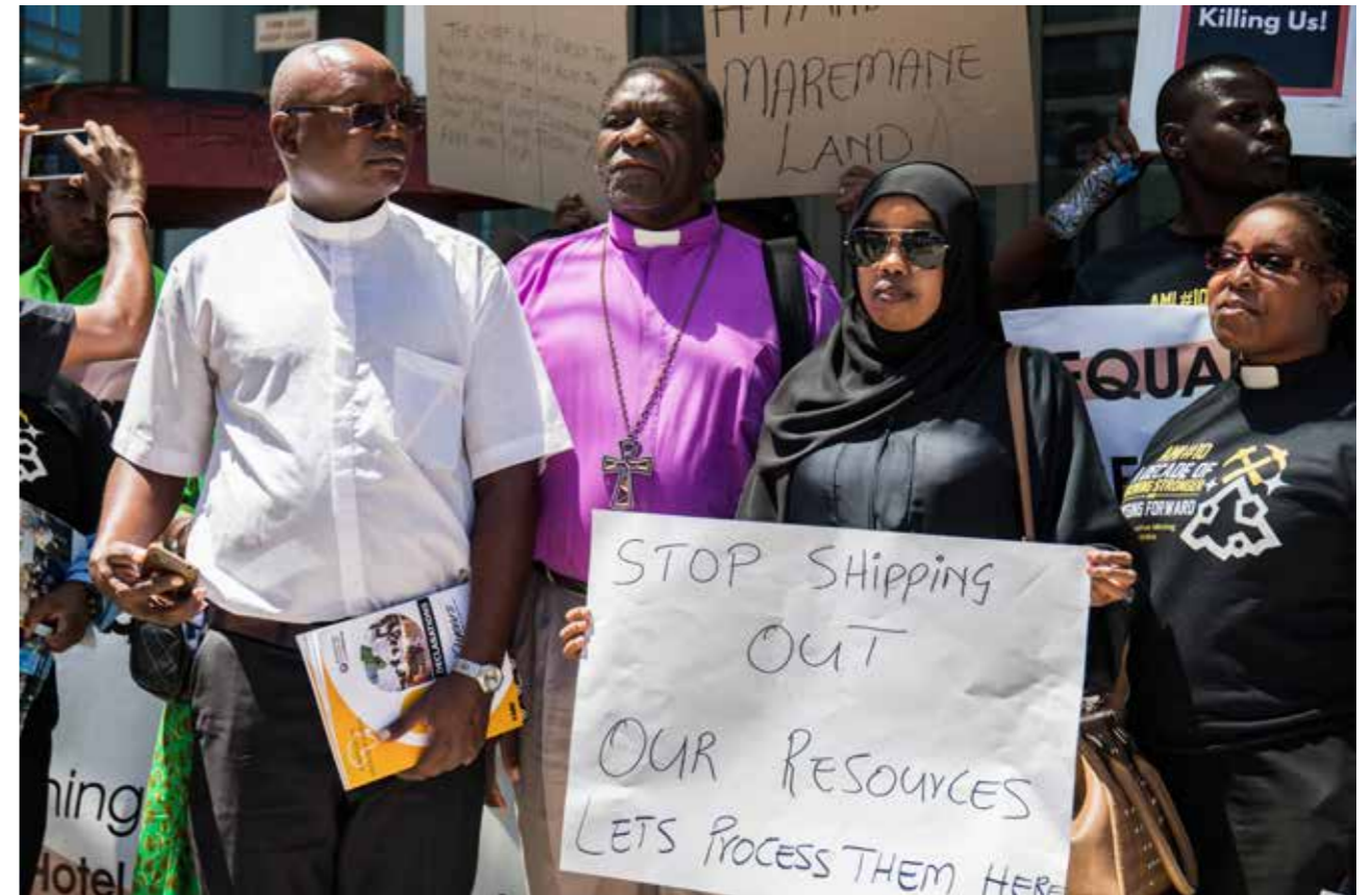
Faith leaders unite to address global inequality at the Alternative Mining Indaba.

The life of Christ was one of poverty, an impression very generally derived from the familiar words of Isaiah 53 and also from Phil. 2:7 (took Himself the form of a slave) and 2 Cor. 8:9 (He became poor that yet through his poverty might become rich). Jesus was a poor man who spent his ministry helping the poor. His public ministry was holistic. Healing and preaching were inseparable and He spent more time on healing than preaching. His ministry was to the whole person. He knew that people with hungry stomachs and diseased bodies need physical liberation in order to hear the word of God – of his saving grace. He stooped low to raise everybody; the lepers, the cripples, the demoniacs, the blind, the deaf, the prostitutes, tax collectors, women and children.