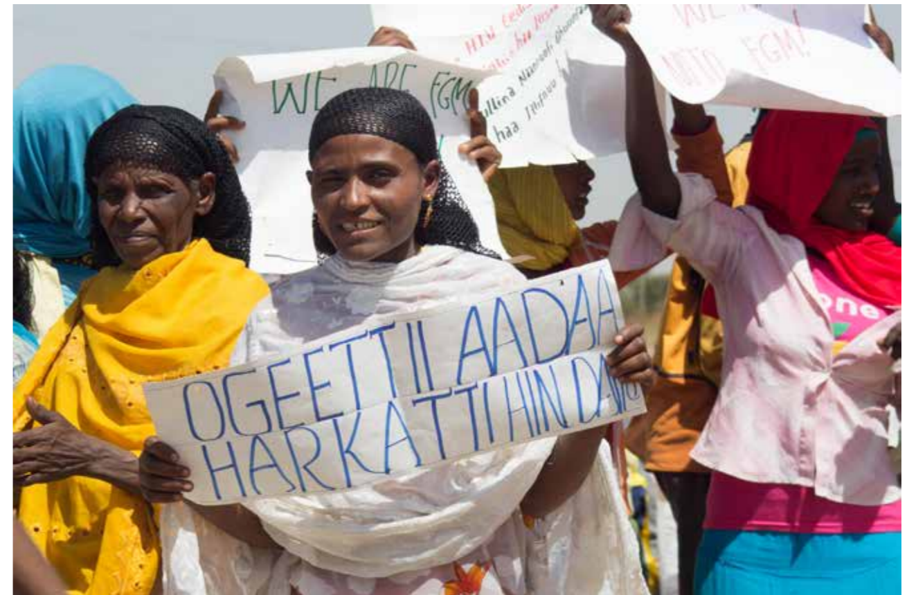
Women protesting against female genital mutilation in Siraro in Arsi, Ethiopia.

Fundamentalist interpretations of religion are giving expression to violent and extremist practices using religion and faith to exclude those who do not conform with a social, economic, political and cultural order. This is limiting women's rights, their access to properties and resources, and the autonomy to decide on their sexual and reproductive life. Religion can also be a barrier to women's access to education and involvement in politics. These limitations are putting women in a vulnerable situation, bringing physical insecurity, and increasing violence and other forms of human rights