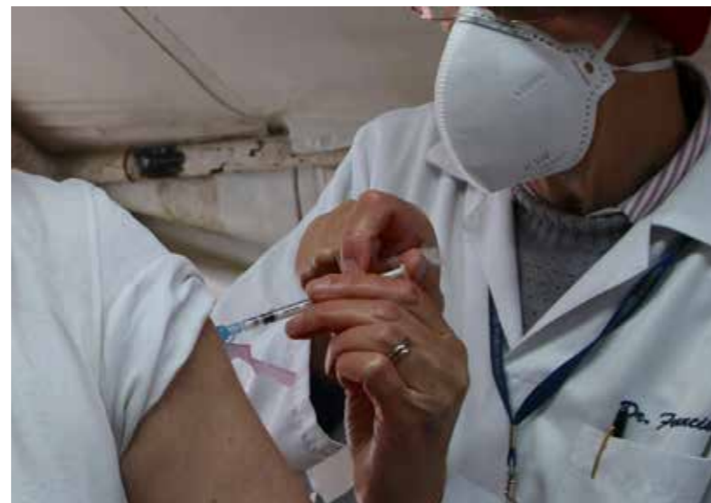
There is unequal access to vaccines.