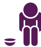
SDG 1 Poverty

Our strategy contributes to the following SDGs: