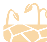
SDG 13 Climate Action