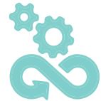
SDG 12 Responsible Consumption and Production