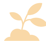
SDG 15 Life on Land