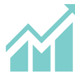
SDG 8 Decent work and Economic growth