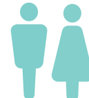
SDG 10 Reduced inequality