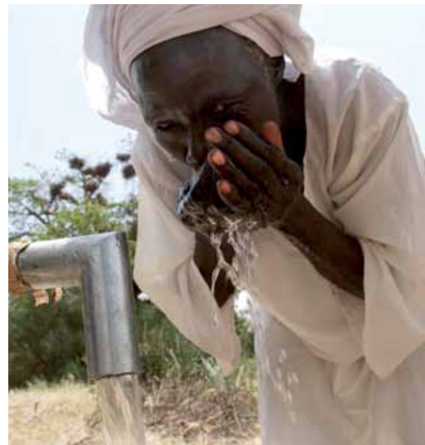
Left: Norwegian Church Aid's partner CHAM distributes food to school children in Malawi. Right: One in six people in the world lacks access to clean drinking water. Water is essential for good health. This water pump in Sudan is installed by Norwegian Church Aid.